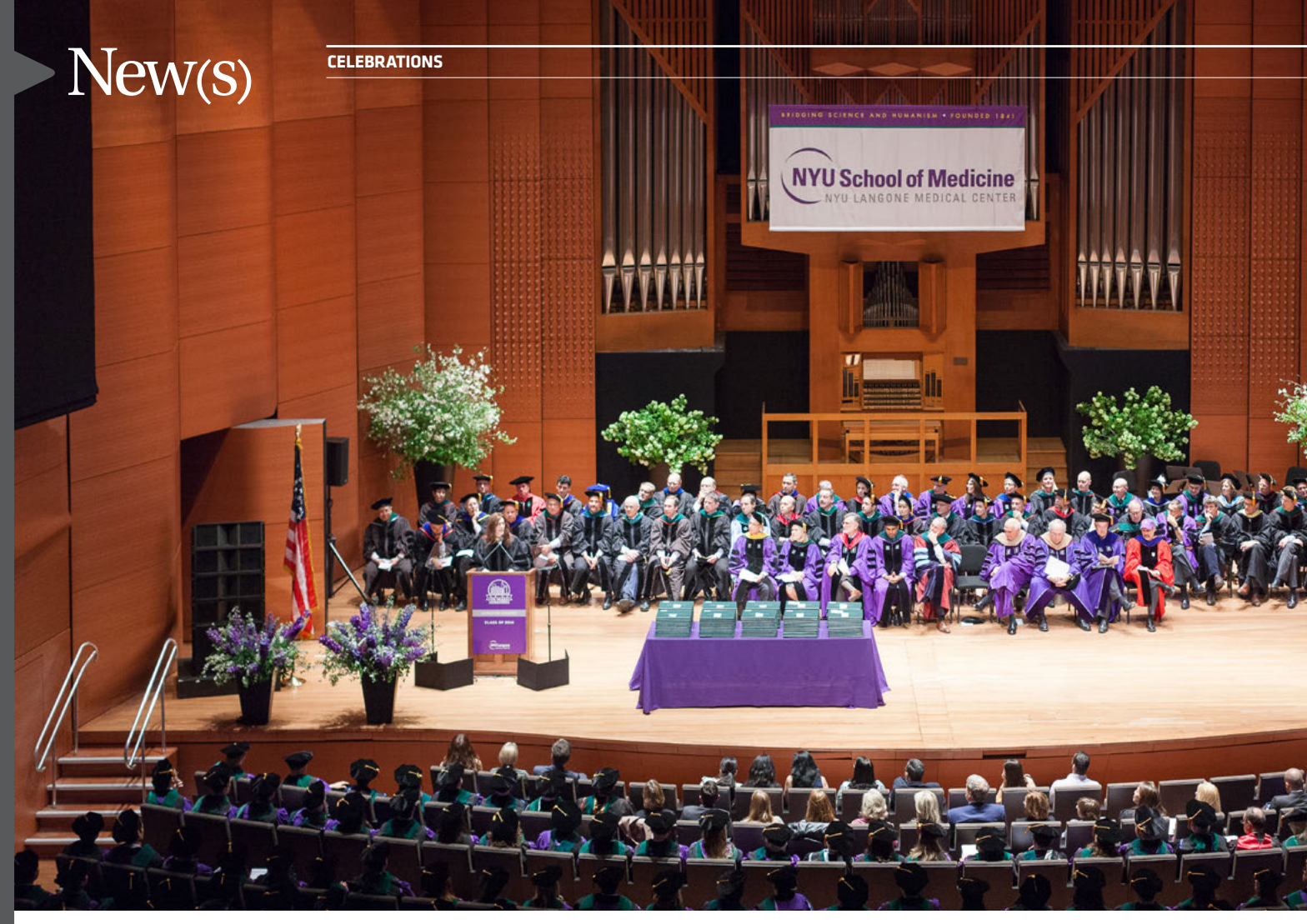
Above: NYU School of Medicine's commencement ceremony on May 18, 2016, in the Alice Tully Hall at Lincoln Center