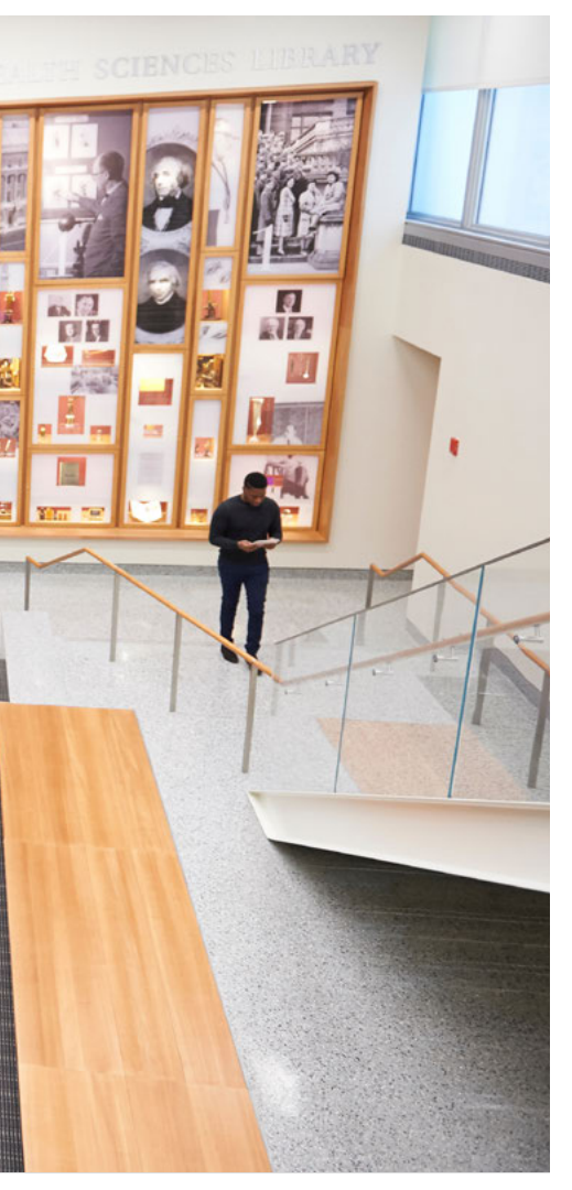
Above: The two-story-high display wall in the lounge at the Sid and Ruth Lapidus Health Sciences Library, which showcases rotating exhibits

digital age, the library also pays tribute to the past. One of its most striking features is a two-story-high display wall that showcases rotating exhibits of rare books, archival documents and photographs, antique medical instruments, and other artifacts relating to the School's 175-year history and the history of the medical profession.