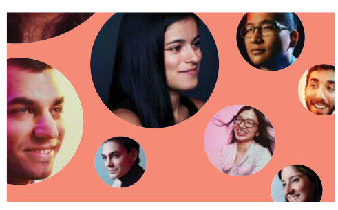
Faces of the Future

After discovering a new cancer treatment for melanoma patients, one of the world's leading physician-scientists reflects on how NYU School of Medicine inspired his innovation.